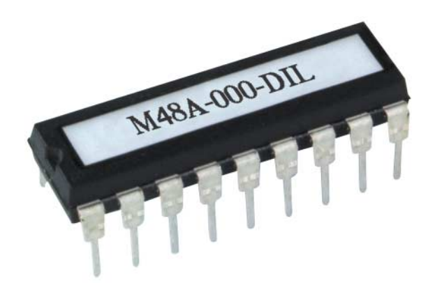
Figure 1: M48A-000-DIL modem IC

The M48A is a half-duplex serial modem controller suitable for use with narrow band receivers, transmitters and transceivers. It supports a maximum transparent data throughput of 4800baud while baseband modulation frequencies do not exceed 3.2KHz. The device supports (programmable) long startup/preamble durations sometimes required for synthesized narrow band devices.